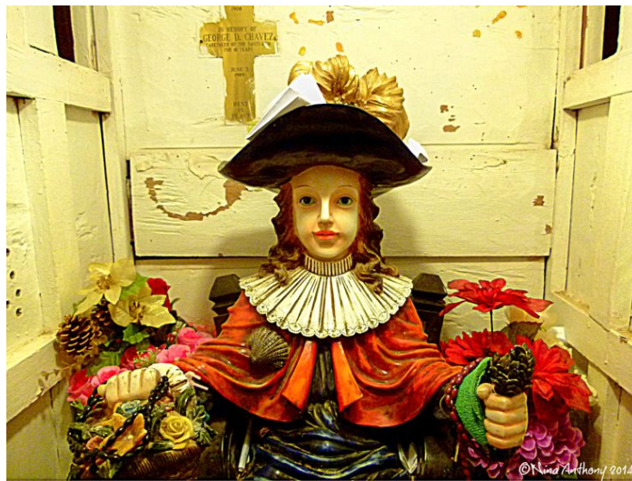
The Santo Niño de Atocha in the Santuario de Chimayó