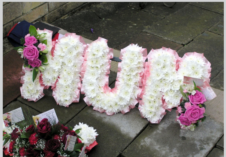
A name tribute at a funeral in Haycombe Cemetery, Bath, England, April 2005