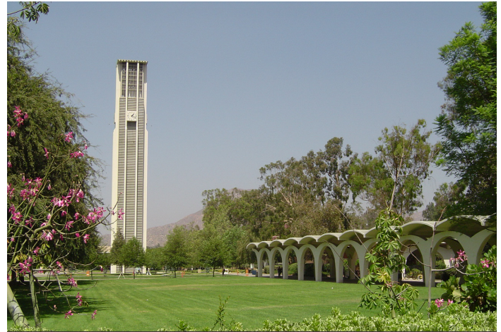
UC Riverside Campus // Marc Buehler

The conference generated themes that reflect the era of the self-reflective medi-