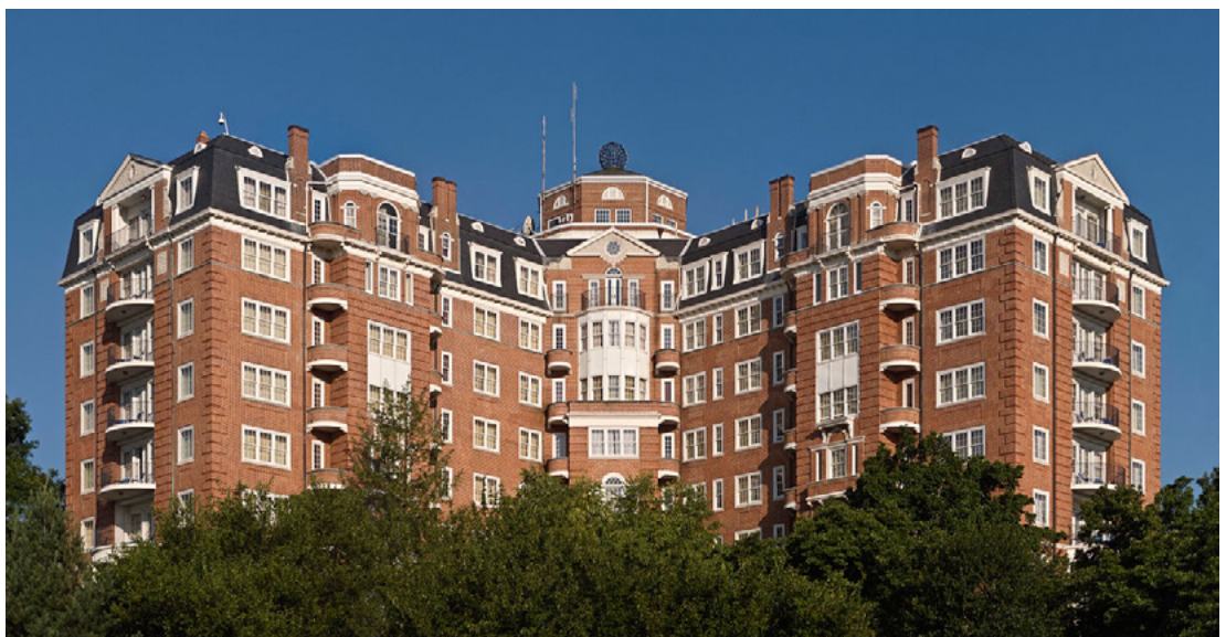
Marriott Wardman Park Hotel, location of 2014 AAA Annual Meeting

There were many others we wanted to invite but weren’t able to due to programming limitations. A few include: “Psyche and Brain in the 21 st Century”; “Metabolizing Environment: Anthropology of Metabolism between Molecular and Eco-Political Scales”; and