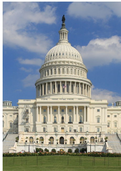
U.S. Capitol west side

Feedback received on the posted draft will be reviewed by CAR's advocacy committee in preparation for sending a version to the SMA board for their endorsement. The statement will remain open for comment through August 29, 2014. To review the statement and submit comment, visit http://bit.ly/1o27e3H .