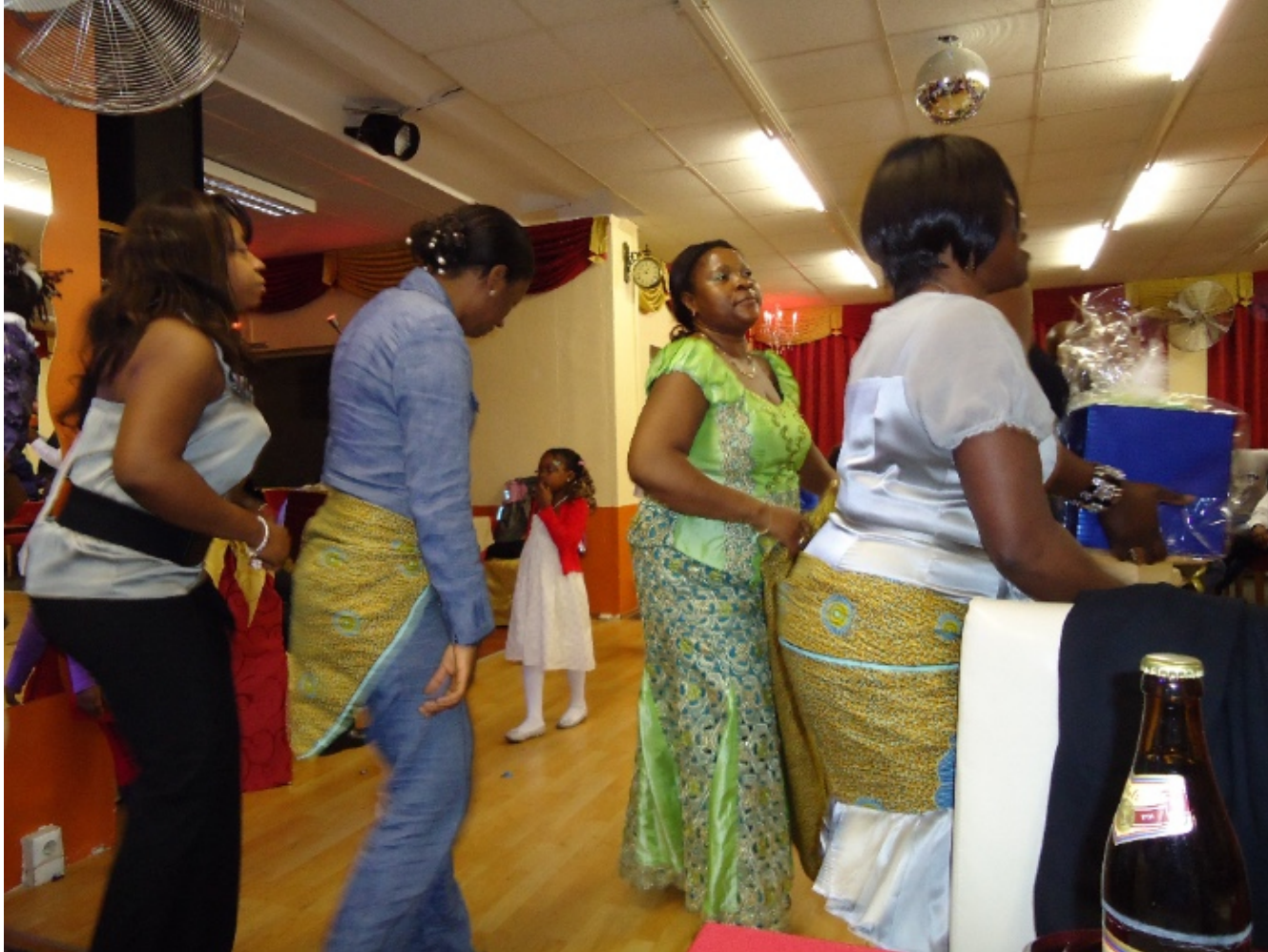
“Shake your shoulders with us,” Cameroonian immigrants dance at a Born House celebration, held in honor of a newborn, fostering belonging to a migrant community, Berlin 2010.