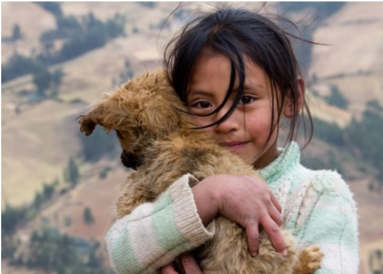
A local girl with her puppy.

Kathryn Oths is a biocultural medical anthropologist with an area specialization in Latin America. Her work has been conducted using a combination of traditional anthropological methods and quantitative research designs.