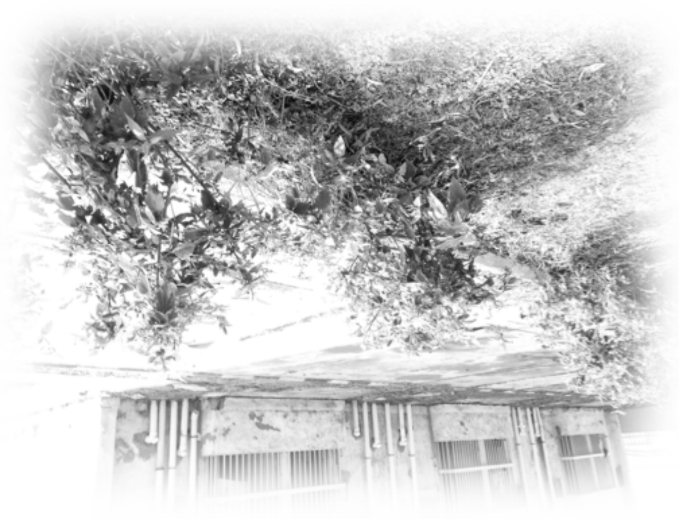
Fig. 2: An upside-down world. This photo was taken by a female inpatient during a photography session organized in the hospital garden. The peculiar image composition is not motivated by an artistic choice, but by the unfamiliarity with the digital camera, a tool many patients saw for the first time on that occasion. In the public psychiatry hospital many goods and services essential for a quality care – and for a dignified life – are missing, as mental health sector in Egypt receives a meager investment from the state health expenditure.