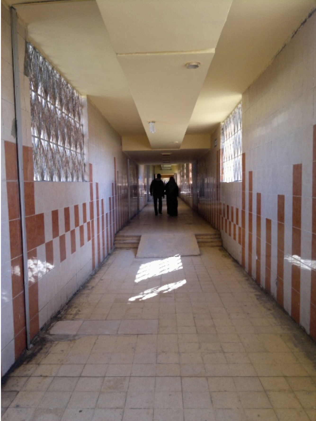
Fig. 1 Entering the parallel world of the asylum. If you come from the outside, from the world of supposedly “normal” people, you may feel relieved when you get through the hospital main gate. Here you hear no noise, see no garbage, and don’t feel bothered by lewd comments on women. Everything is symmetrical and orderly: straight lines prevail and every building has its assigned function. You think everything is under control. Still, you feel at ease only because you haven’t yet met the inhabitants of this invisible city: you are inside it, but still at its periphery.