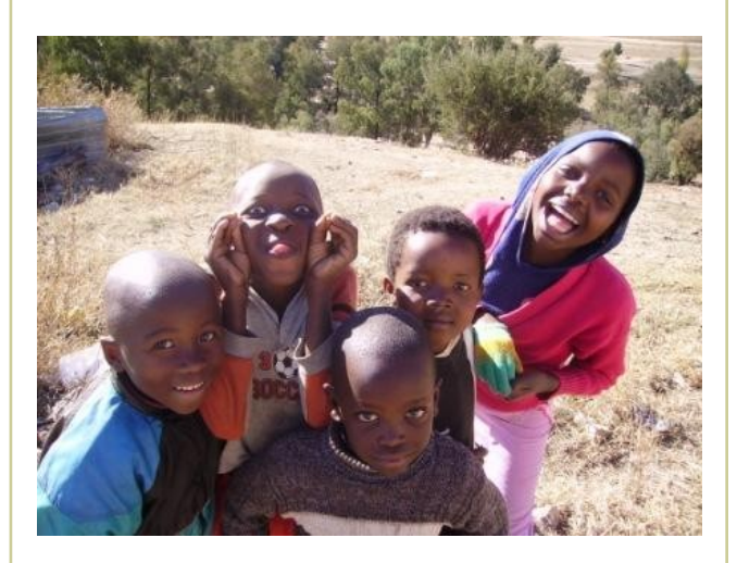
Bastotho Children, 2009.

I would wager that many of you have had experiences such as these. For me, it is these stories, and so many others, that drive me to continue to investigate the links between nutrition and HIV, in a way that considers not only the biological synergy, but also the socio-cultural implications. I think of these women often, considering their tough choices and wondering if I would, or could, choose differently.